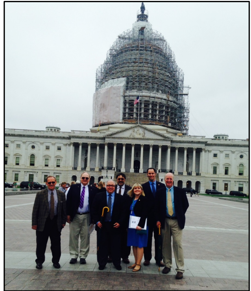
Alaska Power Association team in front of the U.S. Capitol