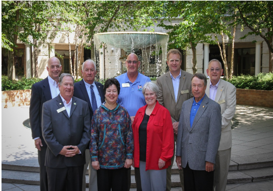
Business and Technology Strategies